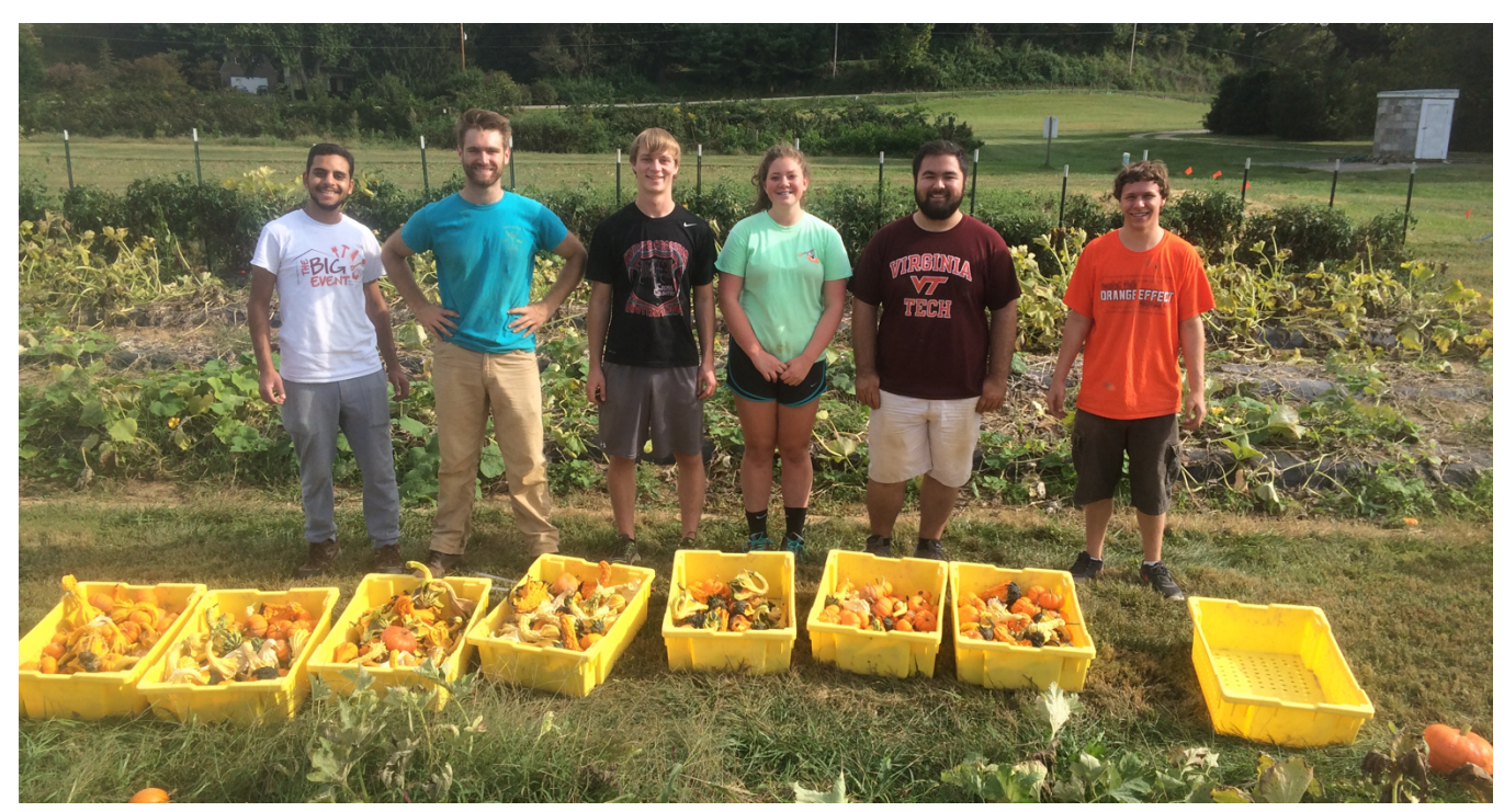
Student volunteers from Engineers Without Borders with a harvest of decorative gourds.