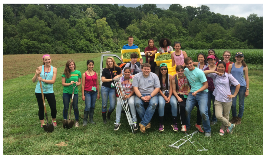
Governors School for Agriculture students at the DSF.

By 2011, the program had grown from its original site to encompass more than two acres. Procurement of produce from the farm to campus was facilitated by a student manager hired by Dining Services, along with the Dining Services Sustainability Coordinator. The Farm Manager-Educator and the Dining Services Sustainability Coordinator participated in curriculum development for the minor and facilitated student volunteering at the farm. Dining Services furnished a farm crew of salaried staff from May to August. By 2014, the farm had increased to six acres, and the Farm Manager-Educator position was transitioned to a joint academic-auxiliary instructor-level faculty position financially supported by Dining Services, CALS, and the Department of Horticulture. In May 2014, with funding from CALS and Dining Services, a high tunnel was constructed at the Urban Horticulture Center (UHC) and utilized for summer tomato and winter salad production.