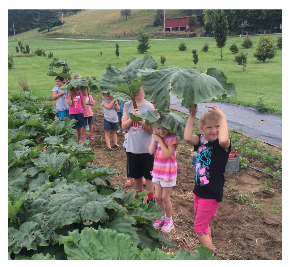
Cloverbud Agriculture Day Camp exploring the rhubarb patch in the herb garden.

September 25, 2015. Dining Services Farm and Dairy Center Tour. Virginia Tech Family Weekend.