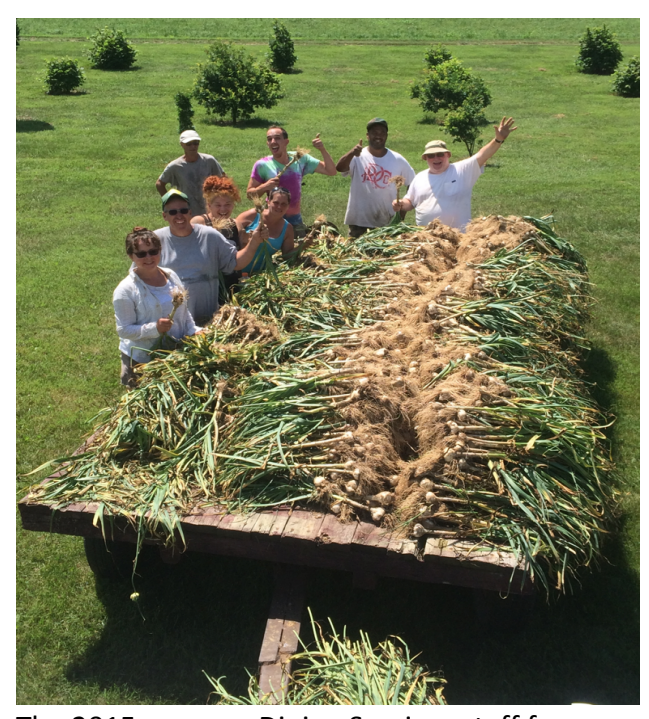
The 2015 summer Dining Services staff farm crew with the year's garlic harvest.