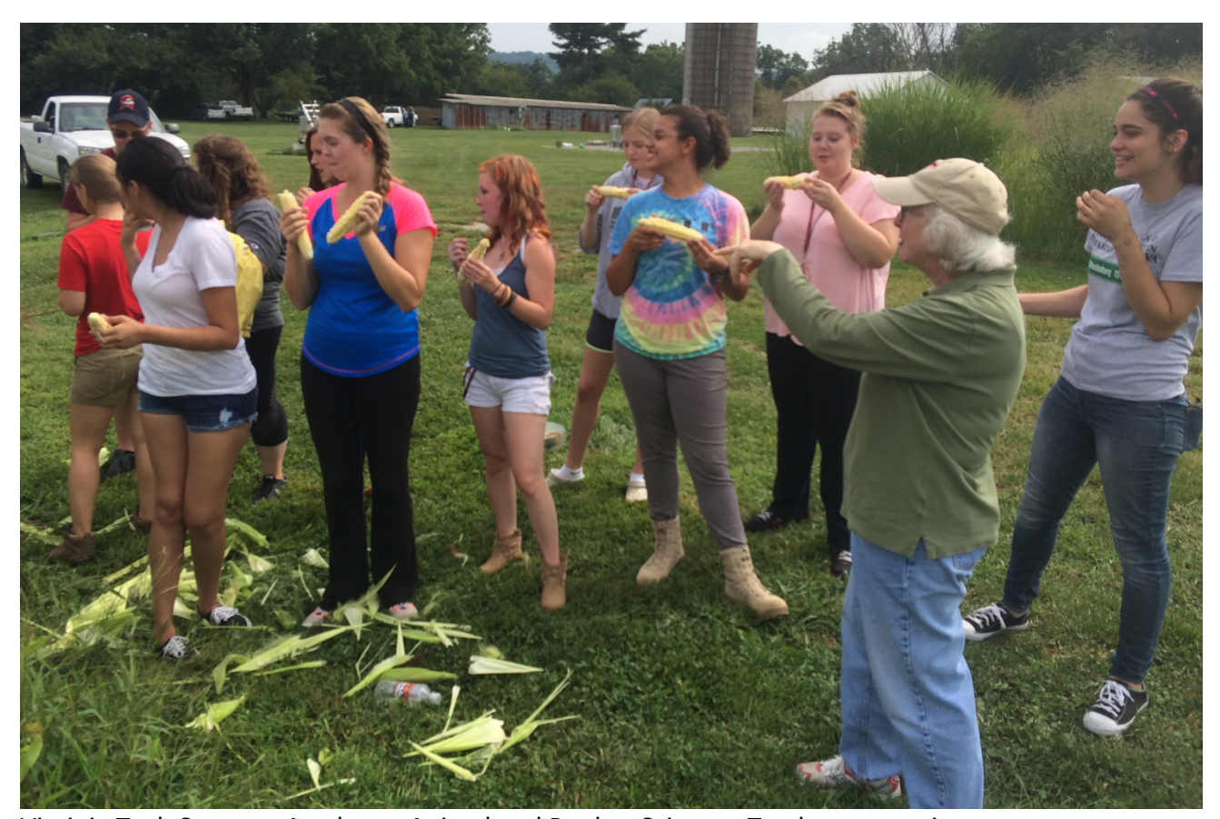
Virginia Tech Summer Academy: Animal and Poultry Sciences Track taste-testing sweet corn.